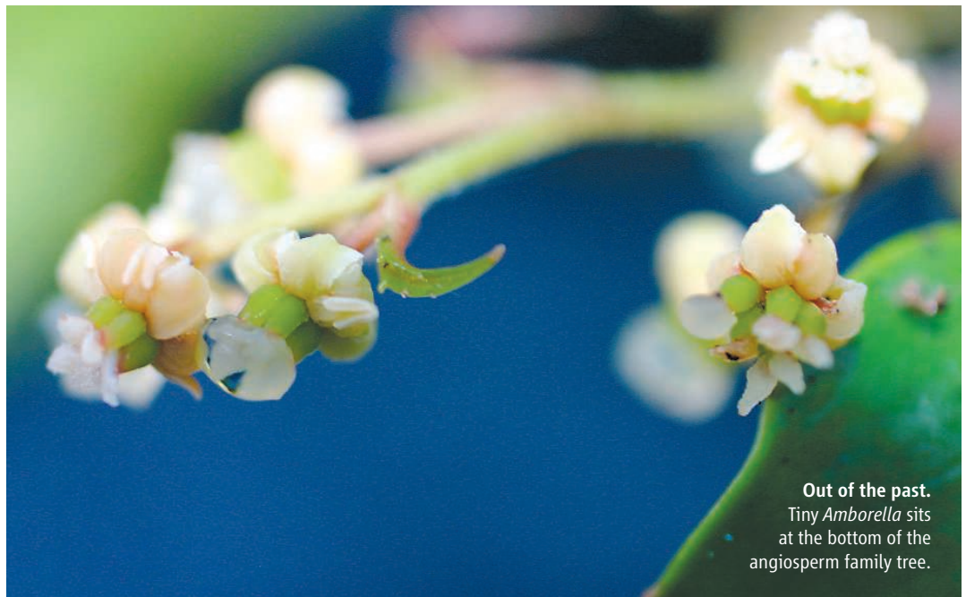
Out of the past. Tiny Amborella sits at the bottom of the angiosperm family tree.

Archaeofructus ’s distinction was short-lived, however. Within months, better dating of the sediments in which it was found yielded younger dates, putting this first flower squarely with other early fossil flower parts, about 125 million years old. Also, a 2009 phylogenetic analysis of 67 taxa by Doyle and Peter Endress of the University of Zurich, Switzerland, placed the fossil in with water lilies rather than at the base of the angiosperms, although this conclusion is contested.