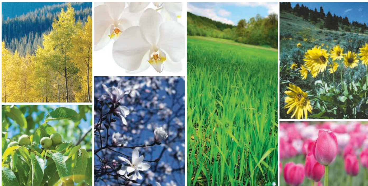
Flowers, food, fuel. Darwin marveled at the diversity of angiosperms. Given that they represent nine in 10 land plants, it's no surprise that they serve as

mainstays of both our welfare and sense of beauty. Clockwise from left: aspens, orchids, grasses, sunflowers, tulips, apples, walnuts.