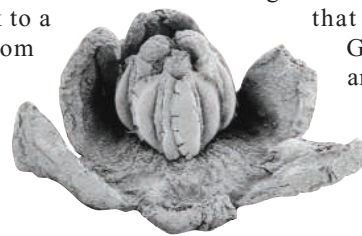
Larger than life. Although merely 2.2 millimeters in diameter, this 3D fossil flower shows that grasses date back to 94 million years ago.

Gnetales organize their male and female organs together in what could be construed as a preflower, he considered them, along with angiosperms, as comprising a single angiosperm entity called anthophytes. For the next decade, most family trees based on morphology sup-