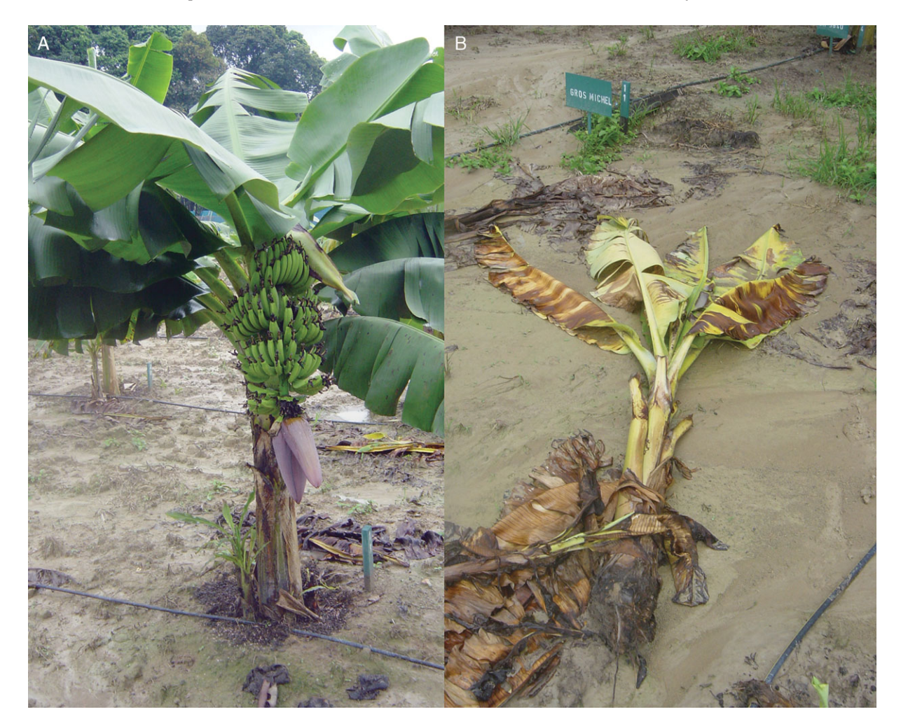
FIG. 2. A, A banana plant with ripening fruit bunch. A sucker is growing from the base of the stem which will form a replacement plant after the fruit is harvested and the mother plant cut down. B, The dessert banana 'Gros Michel' (AAA, 2n=3x=33) killed by Panama disease or Fusarium wilt. 'Gros Michel' was the major export banana before spread of the disease led to its replacement by the variety 'Cavendish' which accounts for nearly all the export trade in banana.

type, while two other AAB plantains with 33 chromosomes had more than 11 B genome chromosomes. Analysis of IRAP markers (see below) indicate that 'Pelipita' lies in an anomalous phylogenetic position away from other species (Desai and Heslop-Harrison, unpubl. res. in work from 2004). Thus backcrossing or chromosome elimination has occurred during the derivation of some varieties. Molecular analyses have suggested the presence of chromosome markers from Musa species other than the A and B genome, and d'Hont et al. (2000) used in situ hybridization to confirm the presence of complete S and T genomes, from Musa schizocarpa and M. textilis , respectively, in some varieties. The diploid variety 'Wompa' was AS, while other genotypes were established as AAT and ABBT.