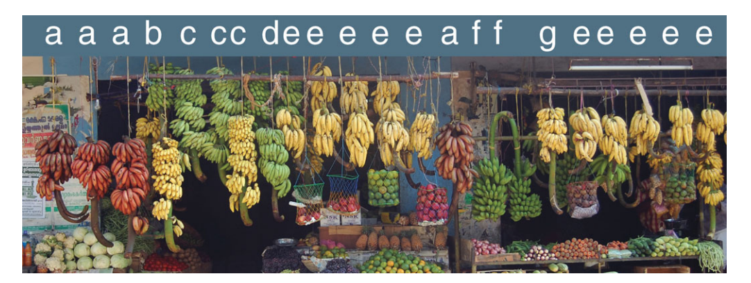
FIG. 1. The diversity of banana and plantains on sale in a shop in south India (Varkala, Kerala State) with various genome compositions. Cultivars are indicated by letters above bunches: a, cultivar 'Red' (AAA genome constitution), a prized sweet dessert banana cultivar. Differences between bunches are mostly from water and nitrogen conditions in the field, and not genetic. b, 'Palayam Codan' (AAB). c, 'Njalipoovan' AB (unripe and ripe, green and yellow) sweet dessert banana with small fingers, thin skin and delicate flavour but poor keeping quality and the fruits fall off bunches. d, 'Robusta' ('Cavendish' group, AAA); 'Cavendish' cultivars ripen without changing to yellow (green ripe) when above 22 °C. e, 'Nendran' (AAB), used for cooking and for making chips. f, 'Peyan' (ABB) used as a vegetable for curries and for cooked snacks. g, 'Poovan' (AAB). (A light tube has been edited out of the picture in the top left.)

The ploidy and genome constitution of banana accessions has been determined by study of plant and fruit morphology since the 1940s; now, methods of numerical taxonomy have refined the approach (Simmonds and Weatherup, 1990; Ortiz, 1997a; Ortiz et al., 1998; Pollefeys et al., 2004). Flow cytometric analysis (Dolezel and Bartos, 2005) is proving valuable for accurate and rapid surveys without growing mature plants. In situ hybridization to chromosome preparations using DNA probes that label the A and B ancestral genomes separately have shown that the full sets of x = 11 chromosomes are present (Fig. 3; Osuji et al. , 1997), and most cultivars have complete genomes of 11 chromosomes. However, d'Hont et al. (2000) used in situ hybridization to show that the variety 'Pelipita' (2n =3x = 33) included eight A chromosomes and 25 B chromosomes rather than the 11 A and 22 B of the normal ABB