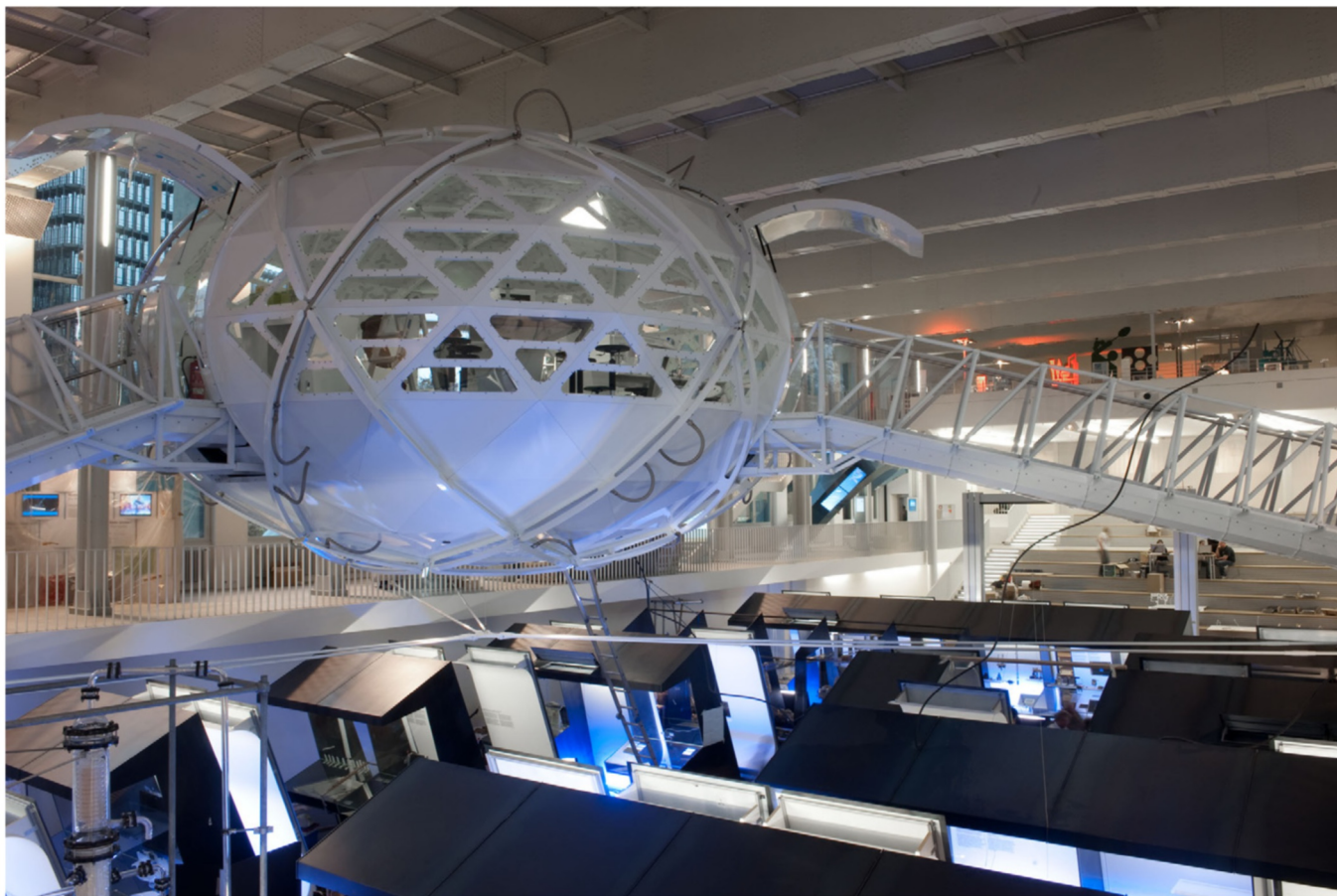
Figure 2. The DNA visitor laboratory at Deutsches Museum in Munich “floats” above the exhibition area.