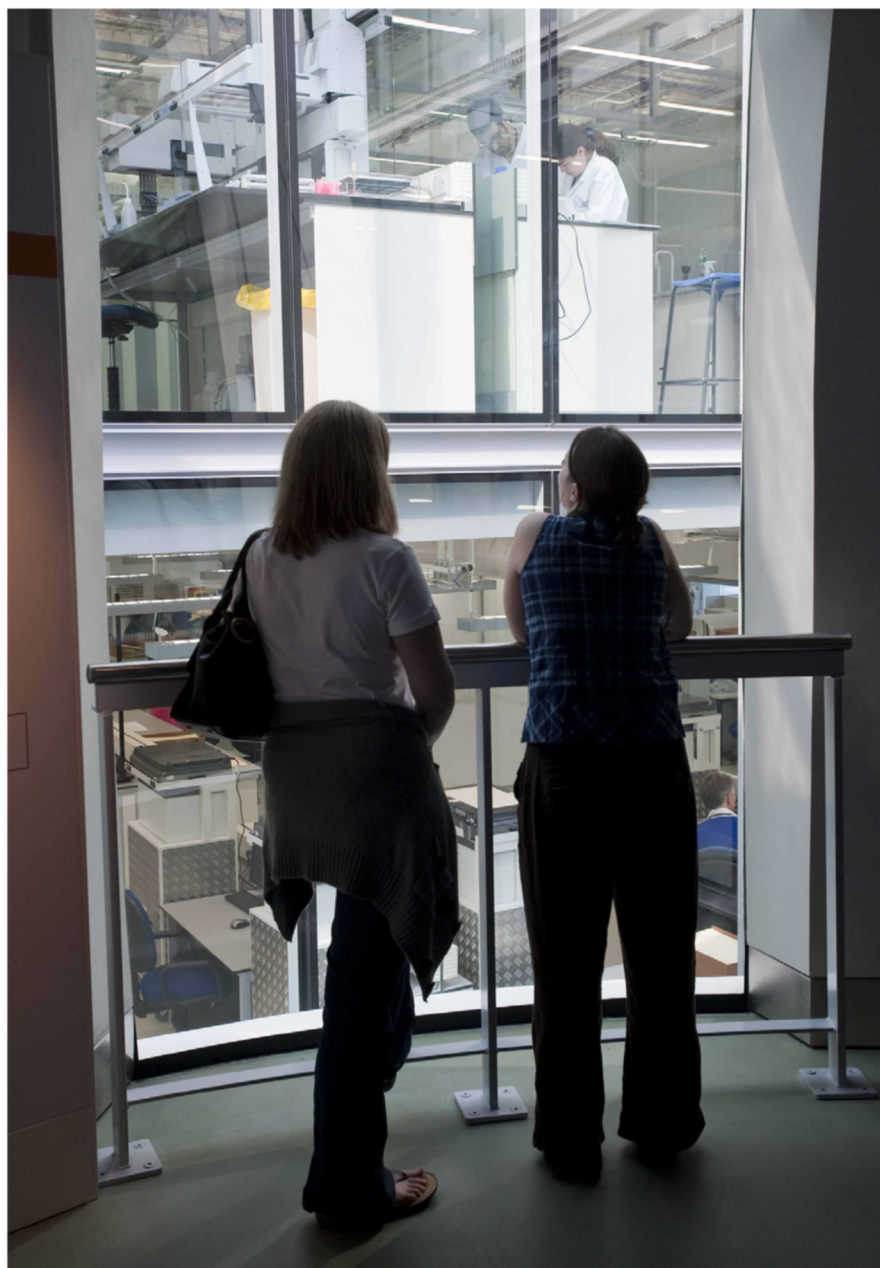
Figure 1. Visitors at the National History Museum in London can watch scientists work in the Darwin Center.