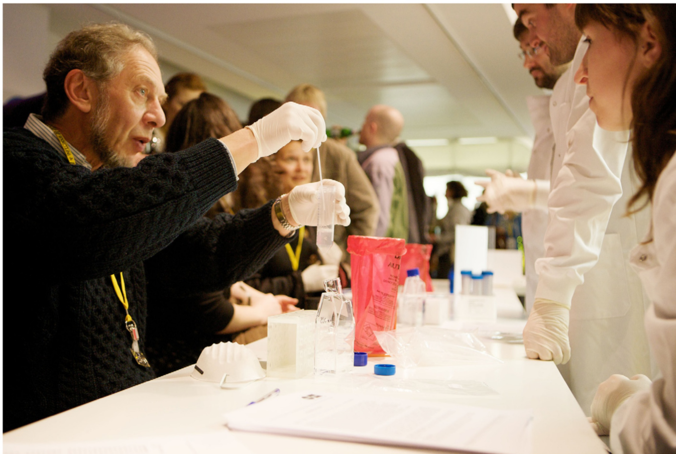
Figure 4. Visitors at the Infectious Exhibition at Dublin Science Gallery.